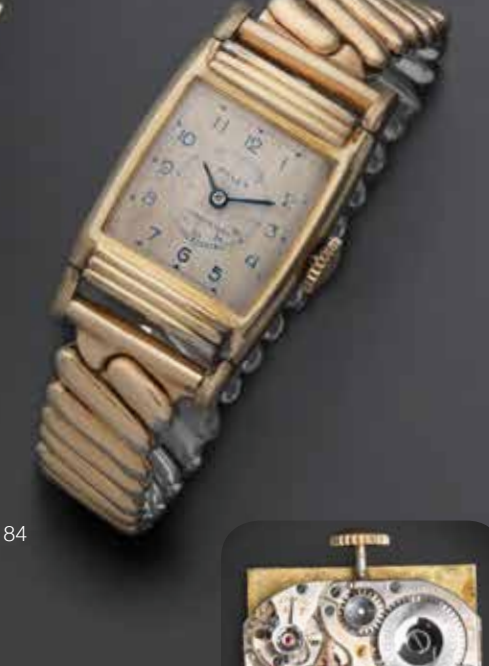
(Lot 84 detail)